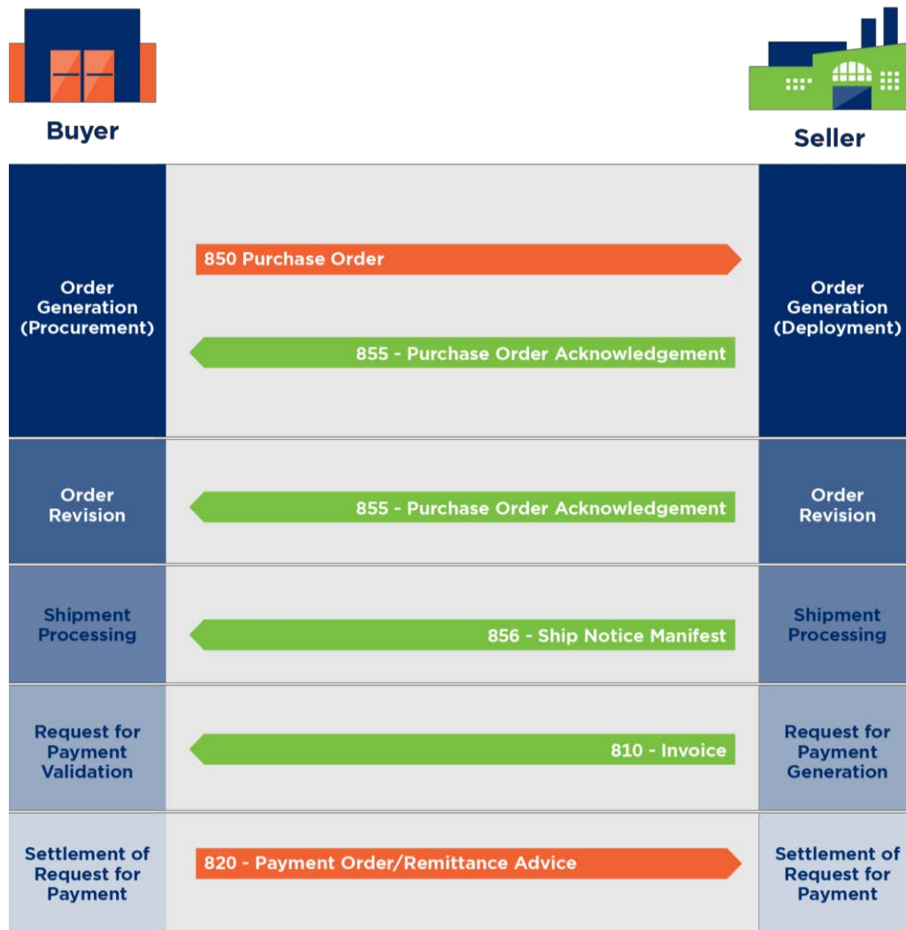
Figure 3-1 General Order-to-Cash Transaction Process Flow